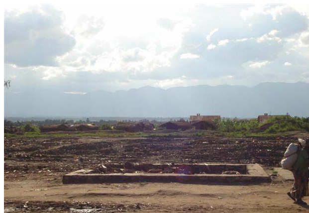
Destroyed IDP site in Nyongera, near the North Kivu town of Rutshuru.

militias. The situation in Goma is calm but tense with CNDP forces located some 13 kilometres from the city. More worrying is the situation in Kibati. UNHCR fears that the civilian population, already in a desperate humanitarian situation, could be caught in the crossfire should fighting resume in the area