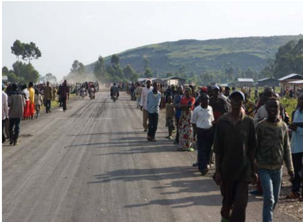
Tens of thousands of displaced Congolese have fled to the North Kivu provincial capital, Goma.

UNHCR does not yet have access to Dungu due to the security constraints but stands ready to assess the situation whenever possible.